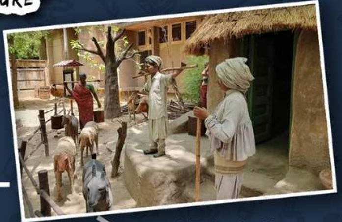
After lunch visit Saputara Tribal Museum, Rose Garden and Lake View Garden.