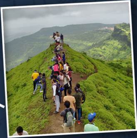
Trek to Governor Hill or Sunrise Point.