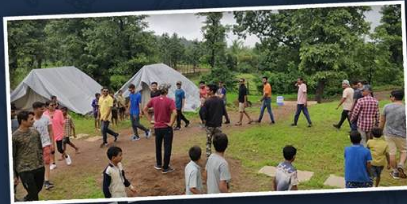
Back to campsite & have Dinner & Garba